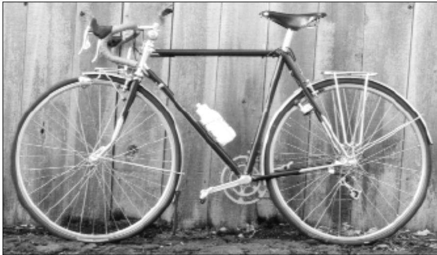
A 2003 Alex Singer randonneur