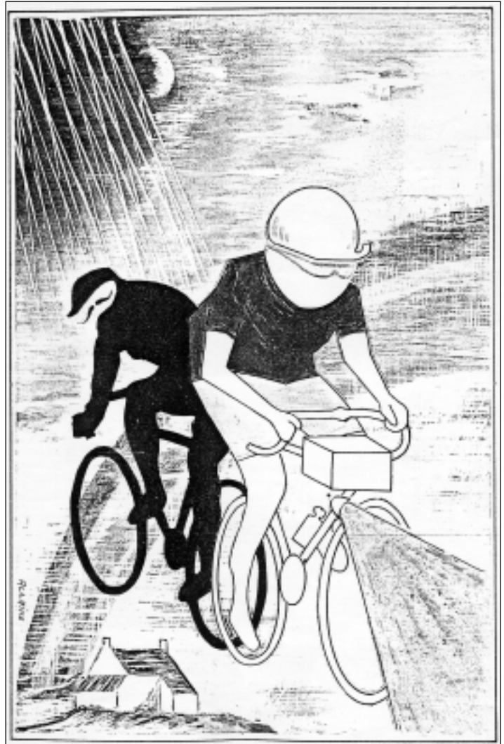
An illustration for the 1991 PBP.

the advent of the 40-hour work week, recreational bicycling grew even more popular in France and the ACP benefited from this. Its free-pace brevets continued to grow across France (though the audax formula was usually more popular in general). In 1931 the ACP organized its first Paris-Brest-Paris