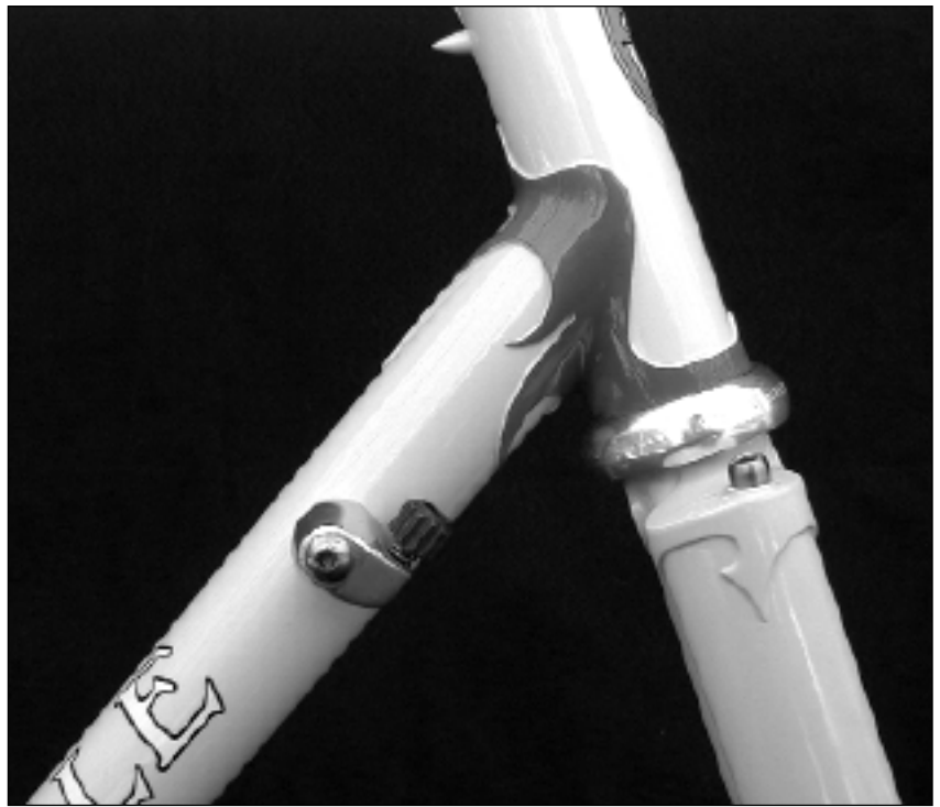
Photo shows detail from the Weigle frame that won the People's Choice award at the Cirque du Cyclisme, an annual vintage bike show in Greensboro, N.C.

Weigle: That's very subjective. There is a lot of debate and controversy about that. Folks are riding PBP on titanium bikes, on carbon fiber bikes, on every